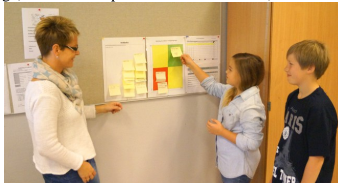
Figure 1 Lean problem solving

Children also take part in improvement activities. At the school "class councils" have been replaced by "class improvement meetings" (from the 4th grade onwards). These meetings take place in front of visual improvement boards. The school has already implemented more than 1,200 improvement suggestions. Aim is on getting a little better every day.